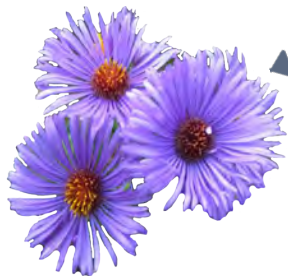
AROMATIC ASTER ( Symphyotrichum oblongifolium ) Blooms Aug-Nov