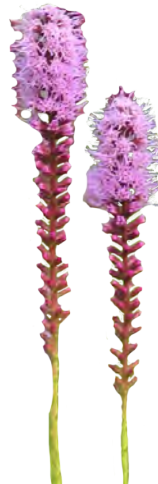
MEADOW BLAZING STAR ( Liatris ligulistylis ) Blooms Aug-Sep