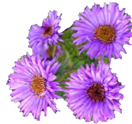
NEW ENGLAND ASTER ( Symphyotrichum novae-angliae ) Blooms Aug-Oct