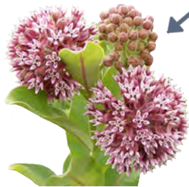
COMMON MILKWEED* ( Asclepias syriaca ) Blooms Jun-Aug