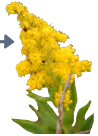
SHOWY GOLDENROD ( Solidago speciosa ) Blooms Sep-Nov