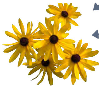
ORANGE CONEFLOWER ( Rudbeckia fulgida ) Blooms Jul-Sep