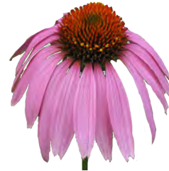
PURPLE CONEFLOWER ( Echinacea purpurea ) Blooms Jul-Sep