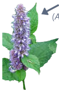
ANISE HYSSOP ( Agastache foeniculum ) Blooms Jun-Sep

Turn your yard into a monarch oasis! These 12 species are some of monarchs' absolute favorites. Three species of milkweed (a plant on which monarchs 100% depend, denoted by *) are included! Learn how you can help monarchs at wimonarchs.org .