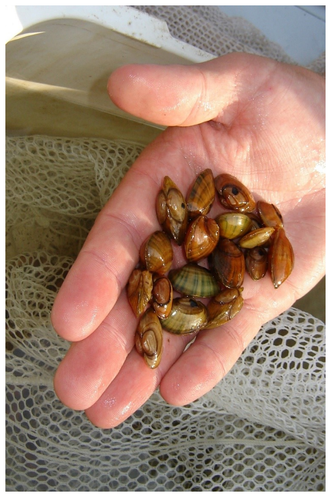
Mussel monitoring.

2018 was the 5<sup>th</sup> year of the Rare Plant Monitoring Program, which continues to make strides in documenting the status of our state's rare plant populations. According to the program's new annual report, 54 volunteers participated last year, together submitting over 200 reports of rare plants. That includes a report of a waxleaf meadow rue (Thalictrum revolutum) population near Cedarburg that hadn't been documented at the site in 42 years, as well as a report of a Rock County population of kitten-tails ( Besseya bullii ) that hadn't been recorded at the site in over 100 years! Get more exciting rare plant stories in the program's <u>online annual</u> <u>report</u>.