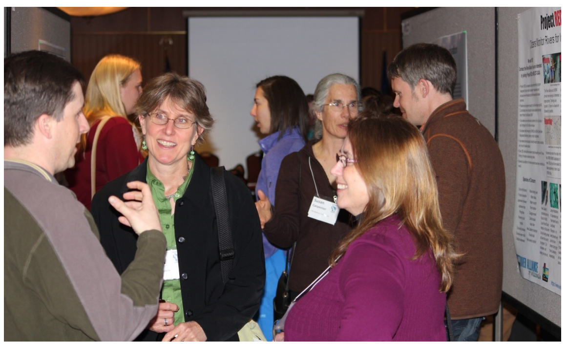
CBM conferences offer a chance to learn and share with other members of the WCBM community.

The Wisconsin Citizen-based Monitoring Network is a collaboration of individuals and organizations that works to improve the effectiveness of natural resource monitoring efforts through communications, resources, and recognition.