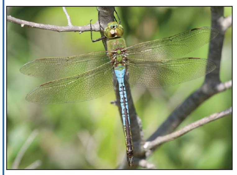
Common green darner ( Anax junius).

The researchers discovered that common green darners have an annual migration that covers North America over the course of three generations. Each year, common green darners emerge in February through May in Mexico and the southern United States. These individuals migrate north to Wisconsin and other states. where they reproduce. The resulting second generation is born in the north and, in late summer or fall, migrates south where they reproduce and die. Their offspring form the third generation of the annual cycle; they do not migrate, instead remaining in the south during the winter and eventually producing the first generation of the following year. That new generation migrates north, repeating the cycle. Read the full article and view migration maps here.