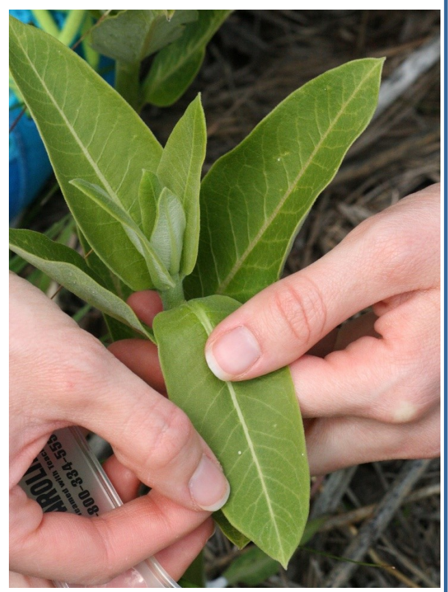
Milkweed monitoring.

Save the date for the 2020 WCBM Network Conference, to be held in Manitowoc. The conference will be an opportunity to network, share your citizen-based monitoring experiences and results, get new resources, and find out about the newest volunteer opportunities. Volunteers, project managers, nature center staff, students, and anyone else interested in citizenbased monitoring are encouraged to attend. We are in the early stages of conference planning, but as more details become available we will share them on our <u>website</u>.