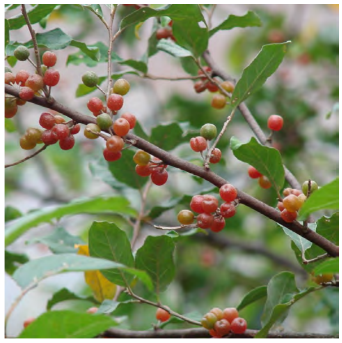
Invasive Autumn olive ( Elaeagnus umbellate ).

when you monitor, take these simple precautions. Use a brush to remove all plants, animals, and dirt from your shoes, clothing, vehicle, and monitoring gear. For aquatic monitoring, drain all water from your boat and equipment; water should never be transported between waterbodies. Watch this short Water Action Volunteers <u>video</u> on the best ways to disinfect equipment.