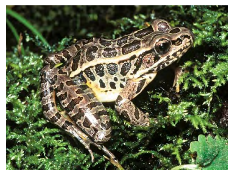
Pickerel frog (Lithobates palustris).

Volunteers are needed to maintain and expand the <u>Wisconsin Frog and Toad Survey</u> (WFTS), which is one of the longest running amphibian monitoring projects in the world! There are two ways to help. Throughout spring and summer, volunteers can conduct acoustic surveys of frogs and toads along predetermined driving routes. Or, volunteers can participate in phenology surveys by choosing a single location and monitoring it for frog and toad calls 1-2 times per week during the spring and summer. WFTS needs new volunteers to conduct road surveys in 26 counties; you can view a map of the routes