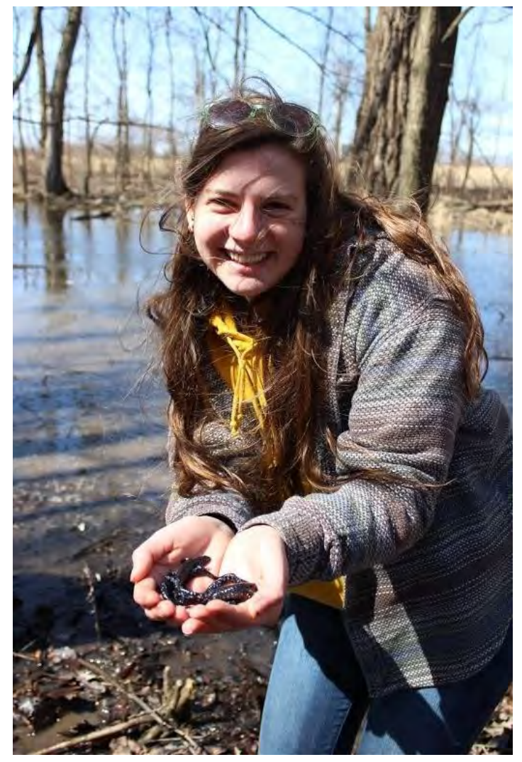
In 2015, Partnership Program funds supported wetland monitoring in Milwaukee County Parks.

The Partnership Program is a joint effort by the Wisconsin Department of Natural Resources and the WCBM Network to fund citizen-based monitoring efforts throughout the state. Since 2004, more than 1.1 million dollars has been shared by 241 projects working to better understand our animals, plants, and habitats. Applications being accepted now through April 6; projects can request up to $5000. View the Request for Proposals <u>here</u>.