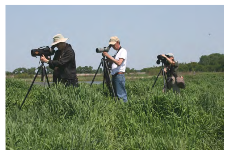
Monitoring in a group at Zeloski Marsh.