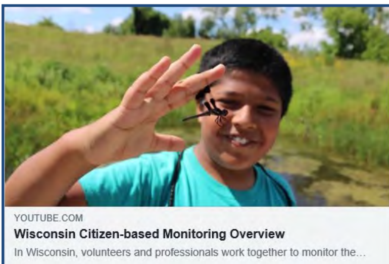
A new video provides an introduction to Wisconsin citizen-based monitoring.