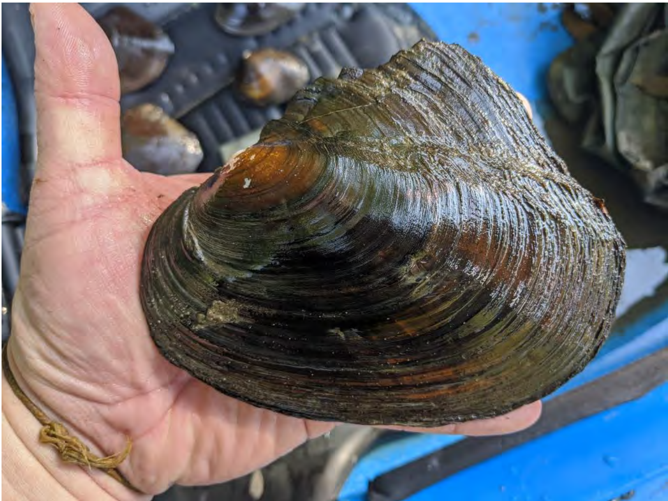
A pink heelsplitter ( Potamilus alatus ) observation submitted to the Wisconsin Mussel Monitoring Program.

Have an update or announcement you'd like to share in our newsletter? Email eva.lewandowski@wisconsin.gov .