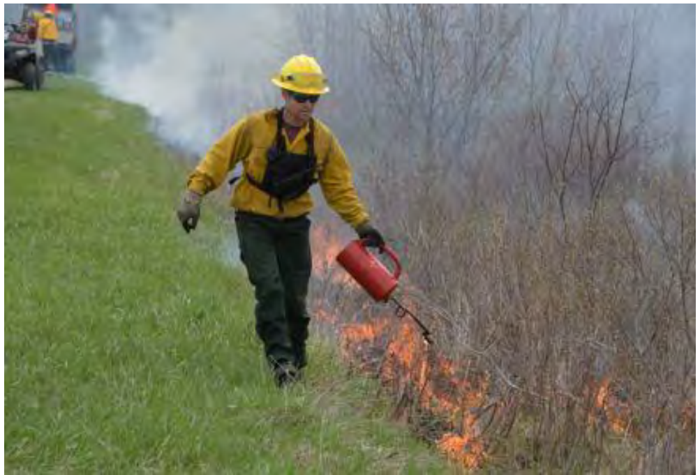
Above: DNR crews conducting a prescribed burn at Oshkosh-Larsen Prairies State Natural Area. Right: Close up of eastern prairie white-fringed orchid.

The story began in 2014 when volunteer monitors John and Maria Scholze were dispatched to check the status of eastern prairie fringed orchid ( Platanthera leucophaea ) along thin strips of land near former rail-