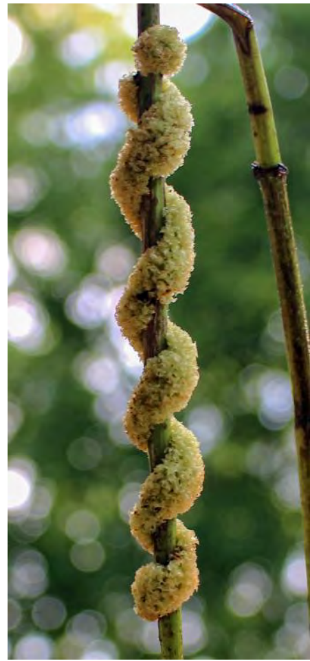
Rope dodder ( Cuscuta glomerata ) is one of the 10 plant records Aaron Carlson submitted in 2016.